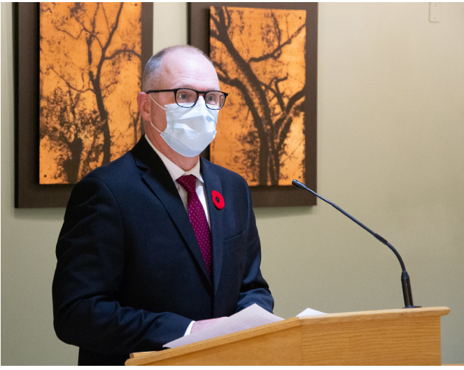
REMEMBRANCE DAY AT DEER LODGE CENTRE | NOVEMBER 2021